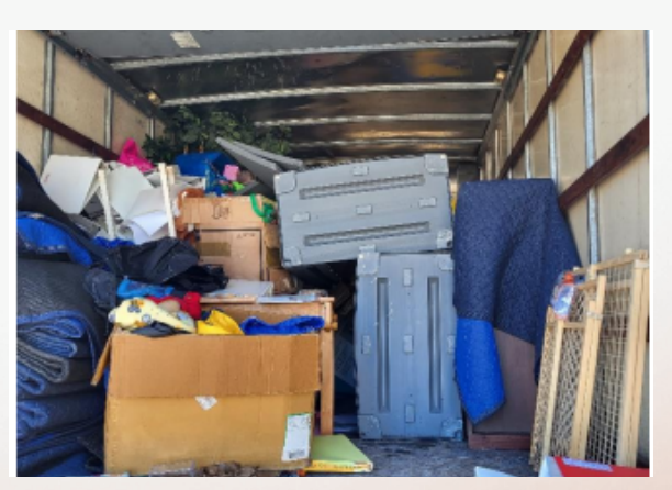
3 Trucks filled with damaged property were carted to landfill.

After much time and dedication, the building was emptied and all the water logged furniture and supplies was thrown away.